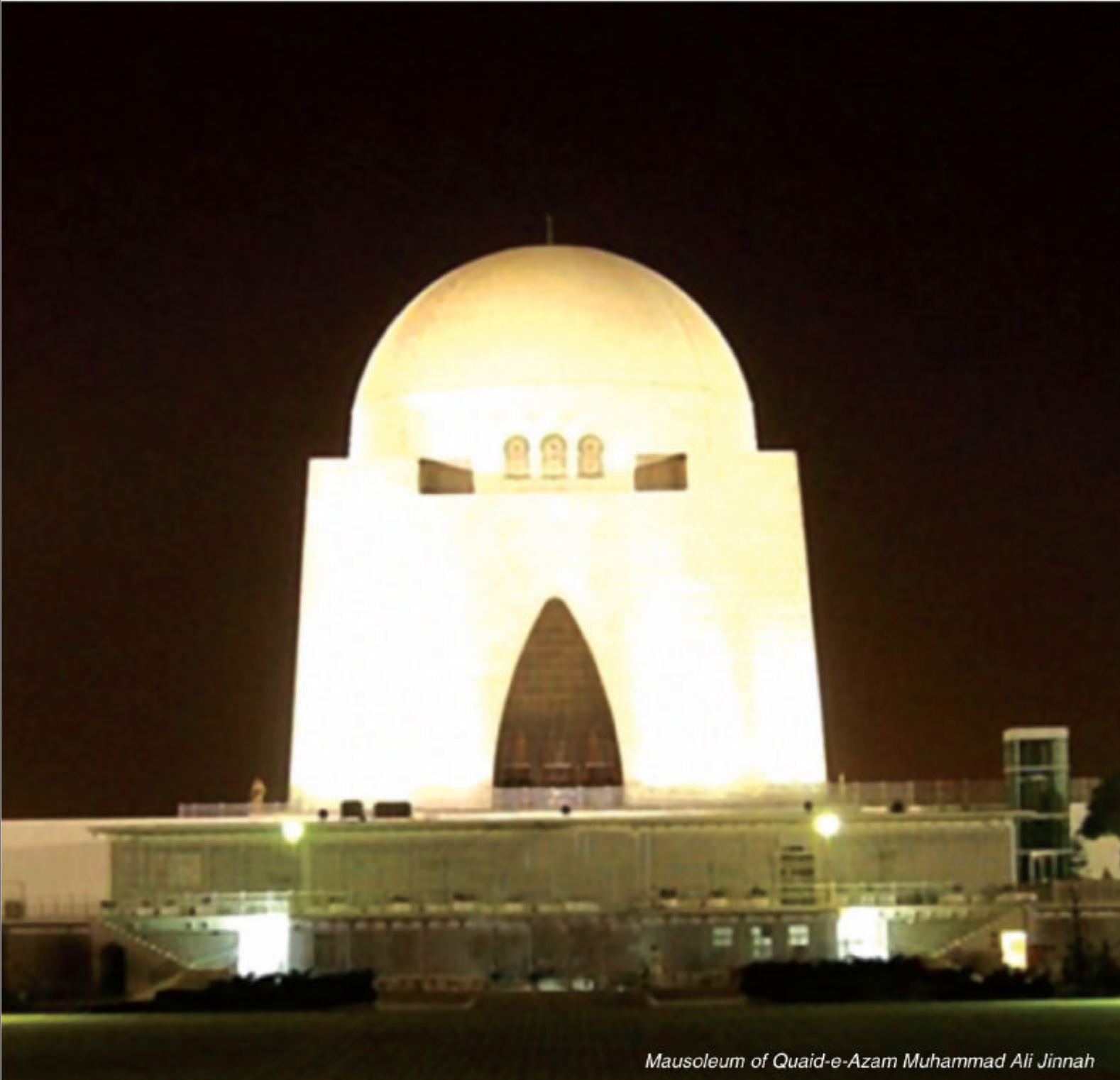
Mausoleum of Quaid-e-Azam Muhammad Ali Jinnah